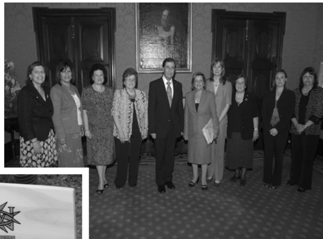
NCW Executive Committee with H.E. the President of Malta Dr. George Abela