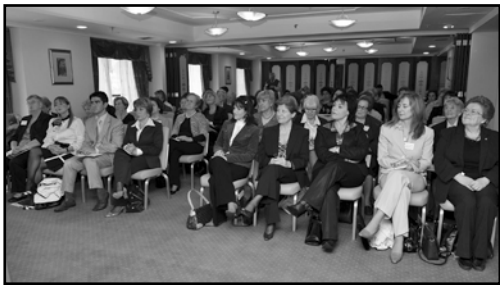
Participants during the seminar "Maltese Women in the European Parliament"

3. Seminar - The meeting opened with a Seminar on the subject of Maltese Women in the European Parliament. Six women