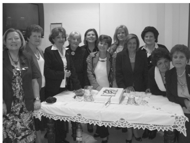
NCW 45th anniversary celebrations