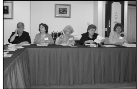
ECICW Working Group

(b) the increase in the gender pay gap. Among subjects to be included in these groups were the family/work life balance, the well-being of children, developments on maternity and paternity leave, and new problems arising for women at a time of economic crisis.