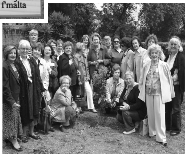
ECICW delegation during the tree planting ceremony at San Anton Gardens