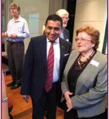
Lord Ahmad of Wimbledon, UK Minister for the Commonwealth