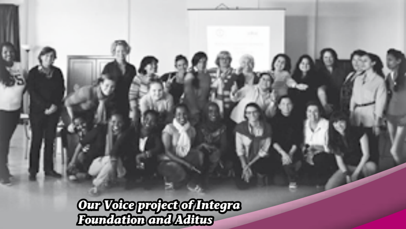
Our Voice project of Integra Foundation and Aditus