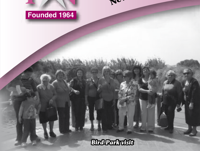
Bird Park visit

Newsletter of the National Council of Women - Malta