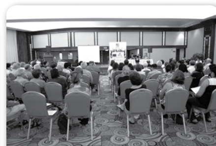
Over 150 enthusiastic participants attended the conference

on specific needs and projects; Target specific groups of people according to needs; Help change the perception of refugees among the local population through raising awareness of the different conditions and situations that they live in.