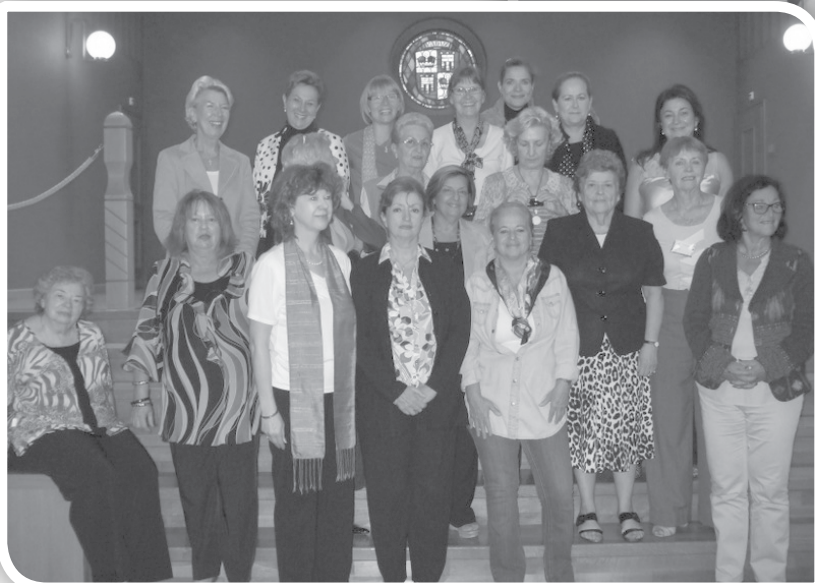
European representatives at the Congress of the Small States of Europe in Liechtenstein