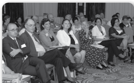
A number of representatives of various volunteer groups attended the conference

There is a need for an official directory of volunteers and categories of voluntary organisations according to sector/theme – for appropriate matching; Giving wider society the confidence that they can indeed work with young people; Involve youths in developing programmes, activities, etc for other youths; Greater awareness could be made with Government and other agencies to promote volunteering; Highlighting the greater need for NGOs working with vulnerable youth; Need for accreditation of skills obtained through volunteering; Need for more training for volunteers working with youth.