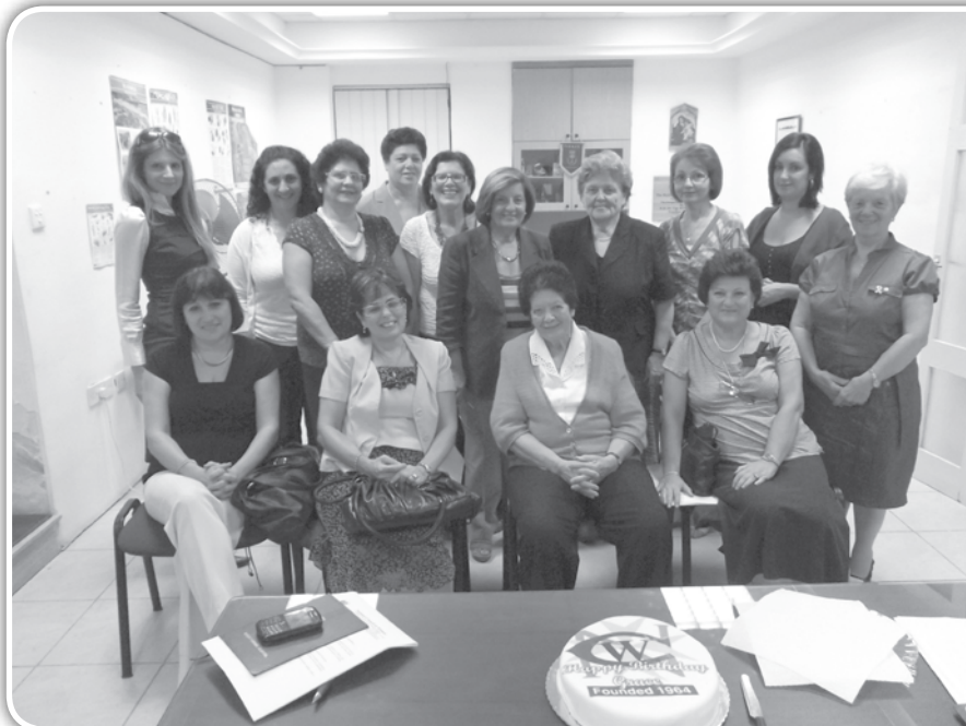
NCW members and representatives of affiliated organisations