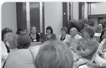
During one of the individual sector workshops at the 2nd NCW conference on Volunteering

Need for greater community-based voluntary-run services, including providing emotional support to elderly in their own homes; Volunteers need to be trained and aware of any signs of elderly abuse and be able to take action accordingly.