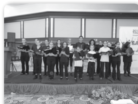
The Drama Troupe Choir opened the conference

Promote sports activities and ways of encouraging volunteers to join sports related club; Encourage actual sport as opposed to virtual reality in schools, which will lead to more people interested in volunteering in sport.