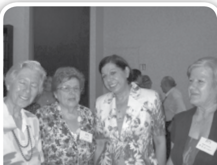
Hon. Dolores Cristina, Minister for Education, Employment and the Family

the potentials and needs of the sector. Recommendations and way forward: In terms of potential and needs identified by the participants, a number of areas of concern emerged as important.