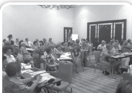
Participants from all voluntary sectors at the EU flagship project volunteering conference

The National Council of Women together with the Commission on Domestic Violence, Nature Trust Malta and the National Youth Council, are currently implementing a project aimed at strengthening the voluntary sector in Malta. The first of four meetings was held on the 28th June 2011. It brought together voluntary organisations and volunteers active.