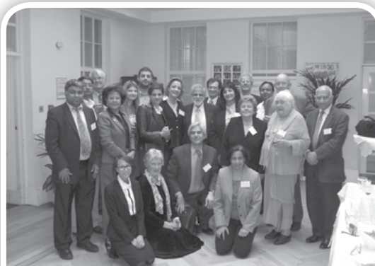
Malta, Cyprus and UK Representatives with the Commonwealth Foundation

society initiatives provide models of good practice in fostering people-to-people links across overlapping histories/identities in the 21st century; What joint EU-CW civil society initiatives can be proposed to CHOGM. The Maltese team put forward the problems of immigration in the EuroMed region, Climate Change and Gender Equity. These three issues were approved as they