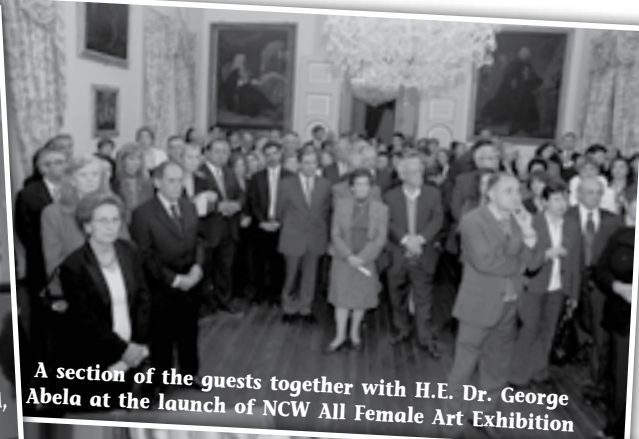
A section of the guests together with H.E. Dr. George Abela at the launch of NCW All Female Art Exhibition