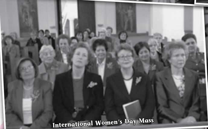
International Women's Day Mass