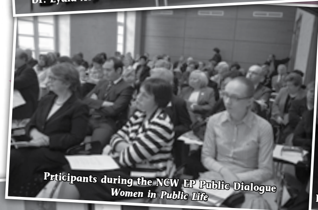
Participants during the NCW EP Public Dialogue Women in Public Life