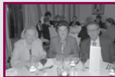
Top table and guests at the Foundation Day Dinner