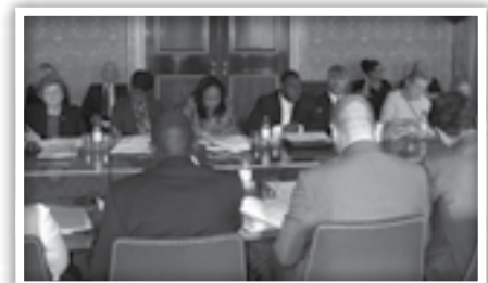
CoW Meeting, Marlborough House