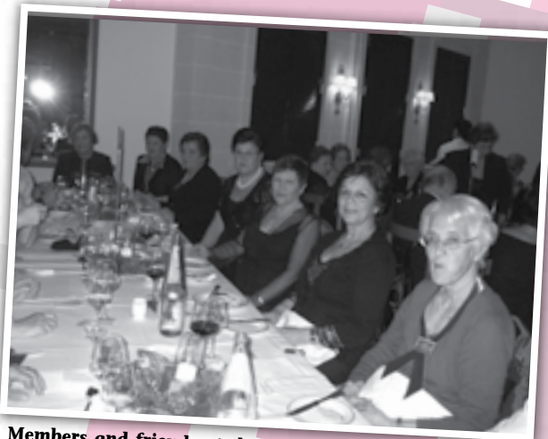
Members and friends at the NCW 2009 Christmas Dinner